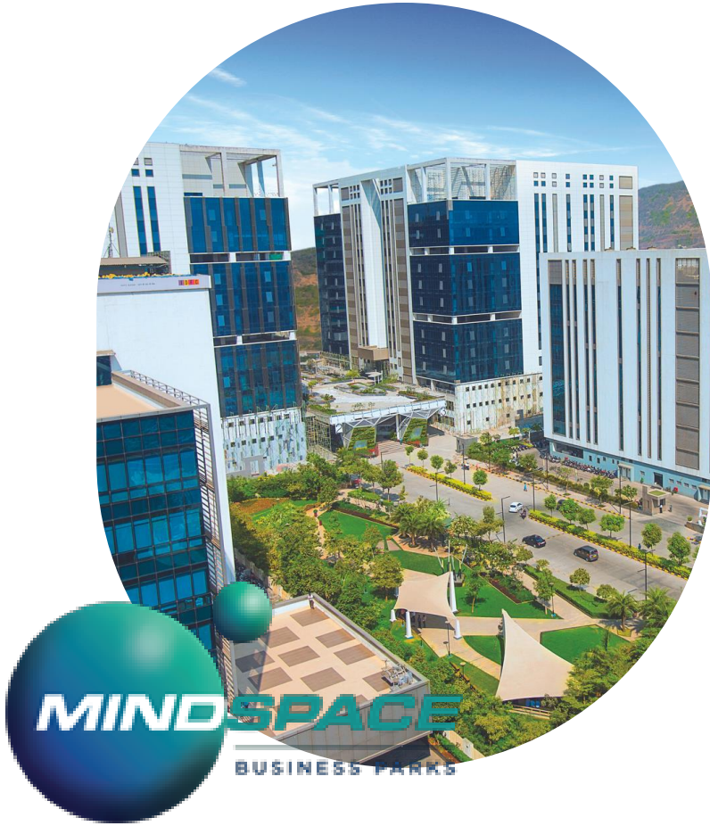
MINDSPACE - Aeroli West Mumbai, India