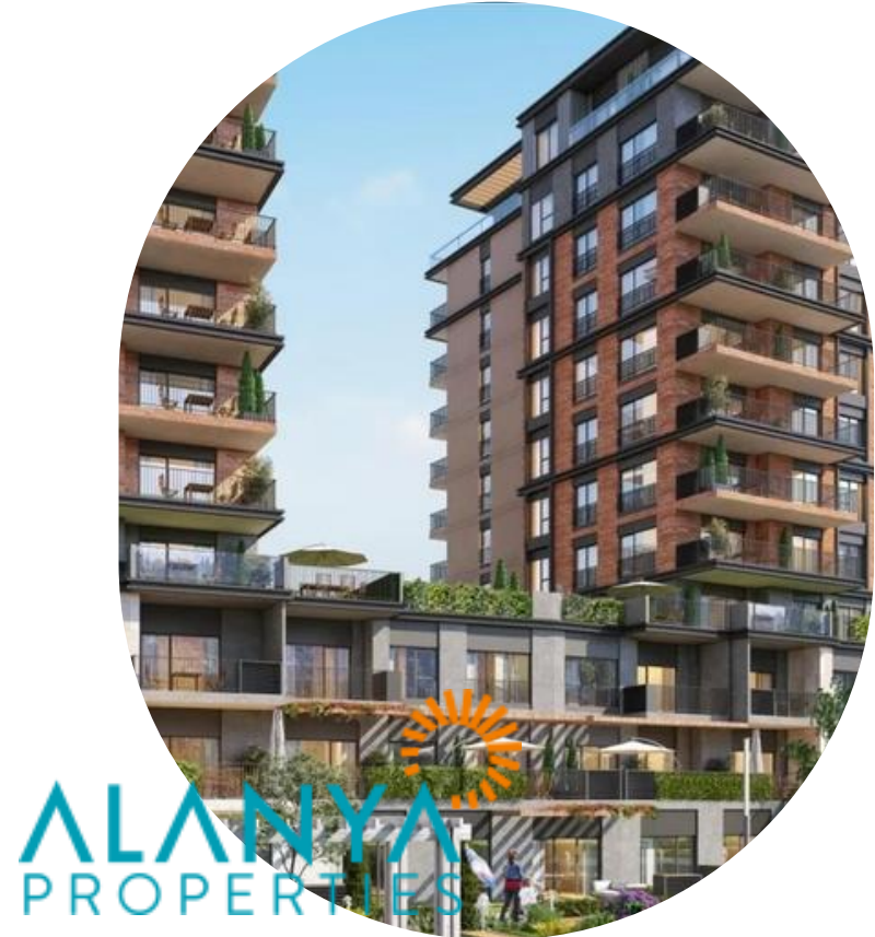
The Country Style Istanbul, Turkey