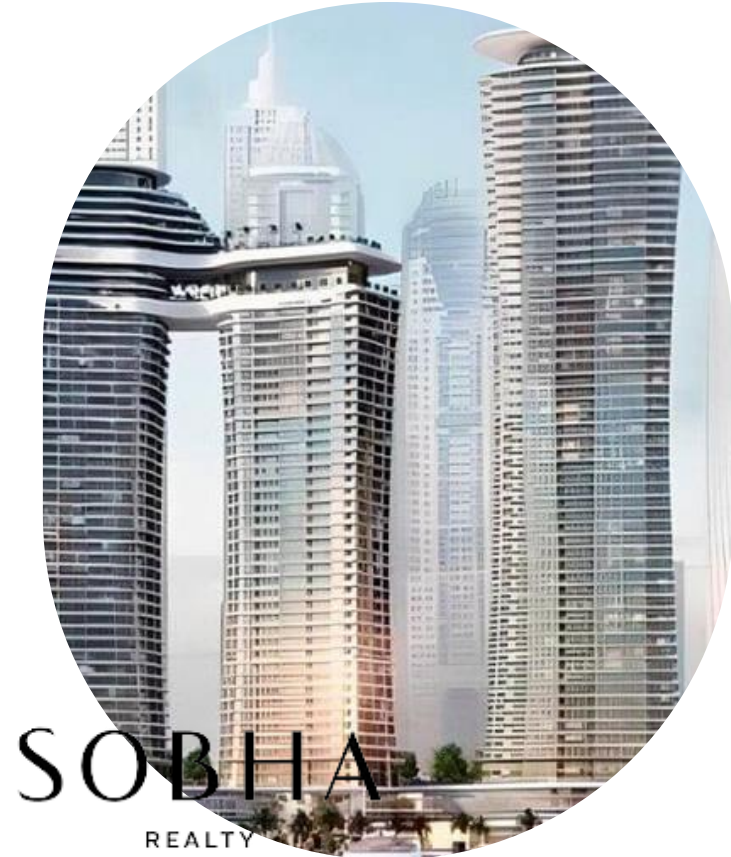
SOBHA SEA HAVEN Dubai, Harbour (UAE)